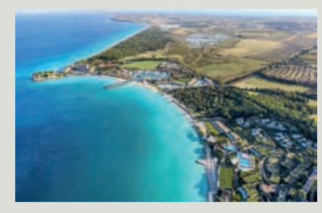
SANI RESORT, GREECE

GIC took a majority stake in Sani/Ikos Group last year, operator of over 2,750 rooms in Greece and Spain valuing the company at €2.3 bn.